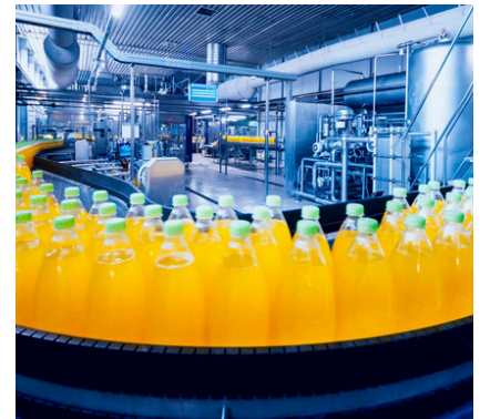
Food & Beverage Industries